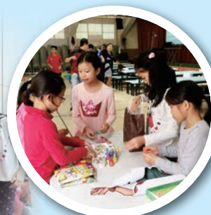
The Care Ambassadors working together to set up the "Pin the Sling Shot" game at the Fun Fair.